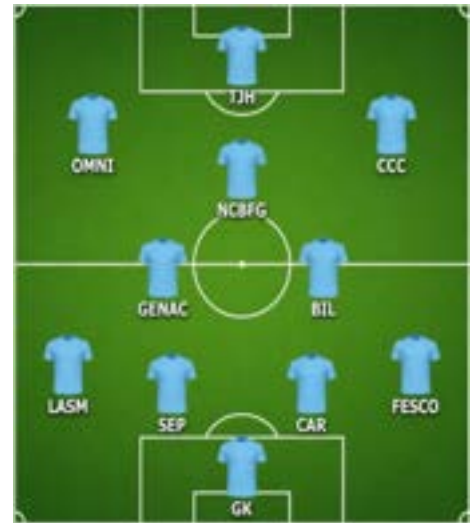
Figure 1: Team JSE's World Cup Starting 11